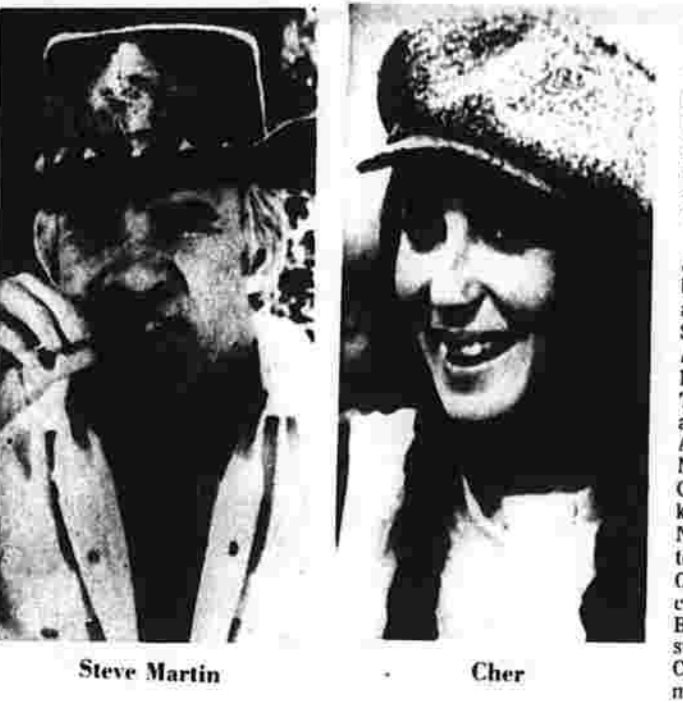
Steve Martin and Cher

At the opening meeting of the National Governors' Association Sunday, the executive committee unanimously passed a resolution calling for the renewal of federal revenue sharing, while saying the states were willing to absorb "our fair share" of the cuts needed to balance the budget.