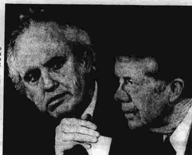
President Carter, with Gov. Julian Carroll of Kentucky, urged the nation's governors Sunday to open their own trade relationship with mainland China and asked their help in the battle to overcome the nation's trade deficit.