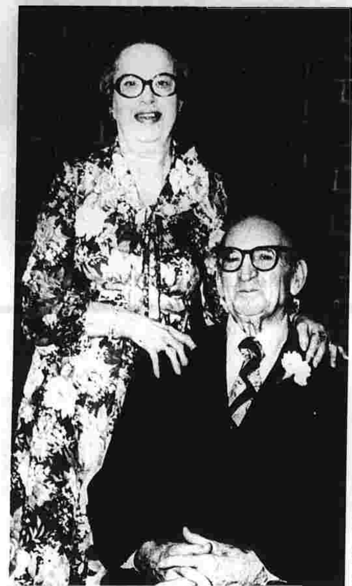
50th Wedding Anniversary

BOLTON - The Friends of the Bentley Memorial Library, Bolton Center Road, will conduct a bargain book sale in the library meeting room on Saturday from 2 to 6 p.m.