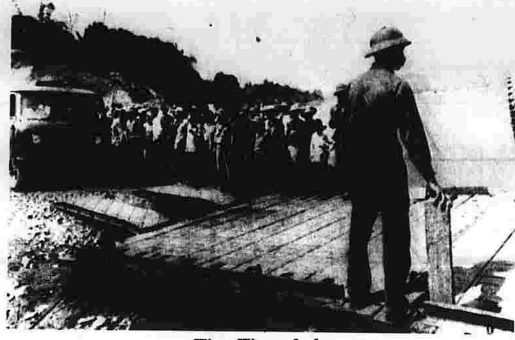
Two Soviet cosmonauts are seen in space today as they prepare for a linkup with the Soyuz 23 spacecraft.

MOSCOW (UPI) — Two Soviet cosmonauts flew toward a linkup with the Soyuz 23 spacecraft today in the year's first manned spaceflight. The Soyuz 23 spacecraft was expected to dock with Soyuz 6 about 24 hours after the Sunday liftoff, which came at 2:54 p.m. Moscow time (6:54 a.m. EST) from Baikonur Cosmodrome.