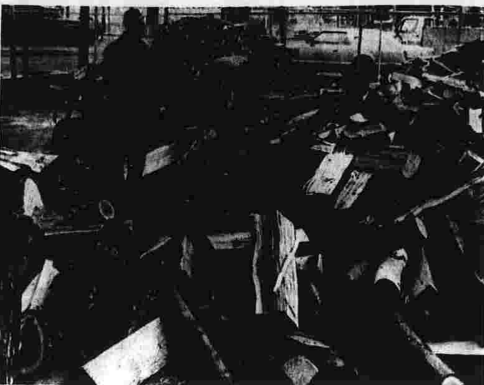
Workers at the Open Hearth Mission in Hartford split wood for area stoves and fireplaces Friday. A bill has been submitted to the General Assembly requiring the wood be sold only by the cord or fraction of a cord to prevent the practice of some wood salesmen who short change the customer with deceptive terms as "truck load."

Jaqueline Onassis - the Gallup poll's most admired woman three years in a row in the early 60s - is out of it now. The People poll turned up 80 percent who would not trade places with her and 78 percent of whom said they would not marry her. Alan Alda emerged as favorite TV actor and Jean Stapleton was favorite actress. Howard Cosell was named television's "most boring man."